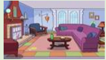
غُرْفَة الْجُلُوس Ghorfat al jolous