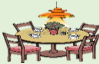
غُرْفَة الطَّعَام Ghorfat al taa'm